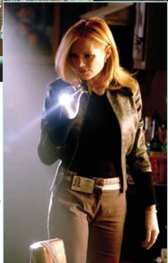
CSI/MULTITASKER Catherine Willows combines roles of real-life investigators.